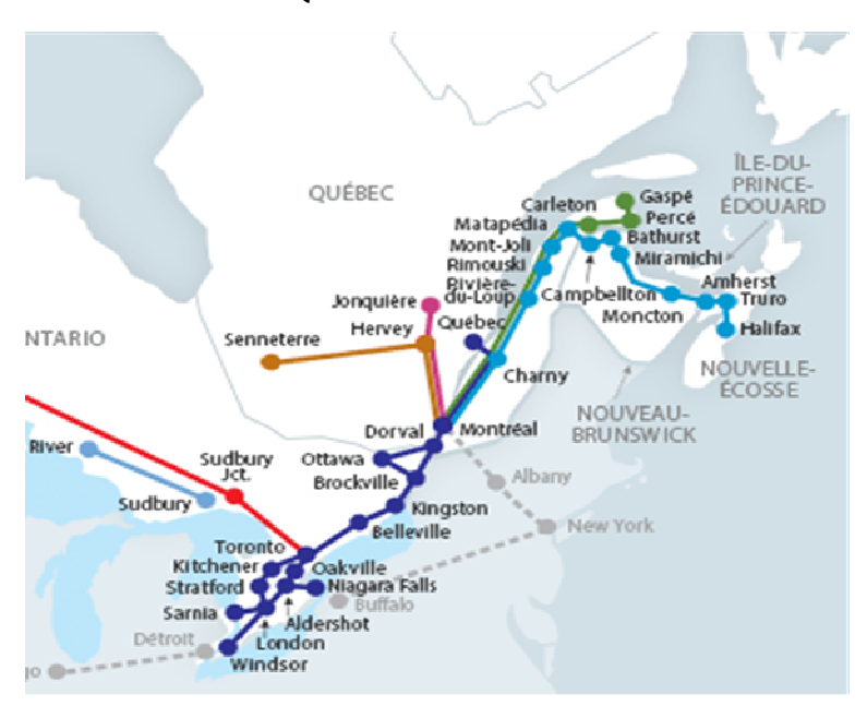
Figure 2: VIA Rail corridors connected to Québec<sup>10</sup>

For some years now, VIA Rail has been promoting a high-frequency train (HFT) between Québec City and Toronto. This train, slower than a high-speed train (HST), would offer hourly departures (except at night) along the corridor. In March 2016, the federal government announced that it would offer $3.3 million over three years to support an in-depth assessment of VIA's HFT plan. In its 2018 budget, the federal government committed an additional $8 million over three years to support the in-depth assessment. The alignment of the HFT and the planned REM now calls for potential cohabitation in the Mount Royal tunnel, which provides access to Central Station from Québec City.