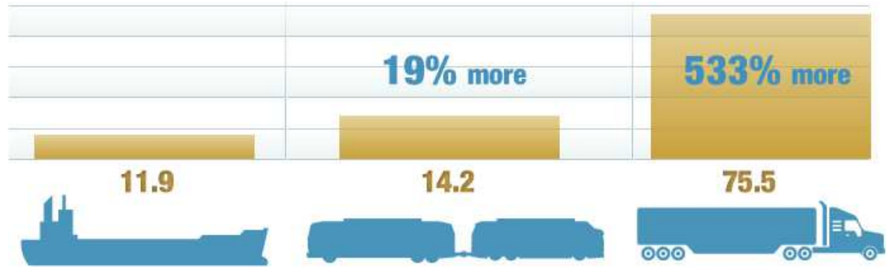
Figure 2: Environmental advantages of freight shortsea shipping compared to train and truck transport CO2 emissions en grams per metric tons per km

Distance traveled per metric ton per liter of fuel